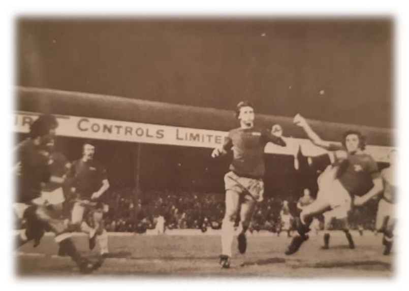
Page 8 of 14

If anyone can help us get in touch with any of the above we'd love to hear from you - see the end of this newsletter for our contact details. Similarly, if any SUEPA member would like to get in touch with a former Shrimper who is not currently one of our members do let us know and we'll see what we can do.