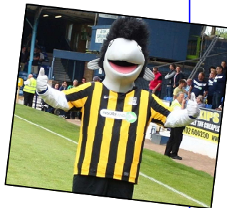
Sammy & Elvis