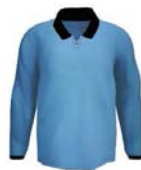
Southern United 1906-10 shirt – Champions, League One (tier 1) 2006; Champions, League Two (tier 2) 1985 £31.50 – £35.00