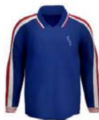
Southern United 1976-78 home shirt – Champions, League One (tier 1) 2006; Champions, League Two (tier 2) 1985 £31.50 – £35.00