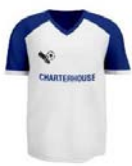
Southern United 1980-81 Division 2 – championship shirt (home) – Champions, League One (tier 1) 2006; Champions, League Two (tier 2) 1985 £31.50 – £35.00