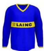
Southern United 1985-86 home shirt – Champions, League One (tier 1) 2006; Champions, League Two (tier 2) 1985 £31.50 – £35.00

We currently have 5 Shirts in our Retro Range partnership with Chablais Sport including the very first shirt from 1906-1910 and are planning the next one, any thoughts on what you'd be interested in would be welcome.