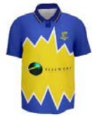
Southern United 1960-68 home – Champions, League One (tier 1) 2006; Champions, League Two (tier 2) 1985 £31.50 – £35.00

As before, there is a full adult size range, junior shirts, a babygro, options to have either long or short sleeves, and, if required (at no extra cost) a name and number on the back.